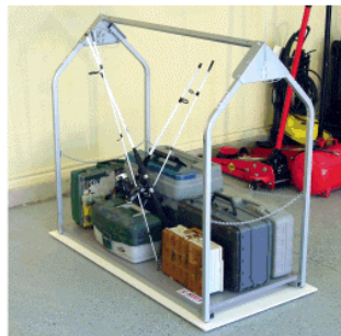
Fishing Poles, Tackle Boxes