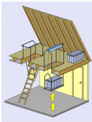
2. Press the UP button