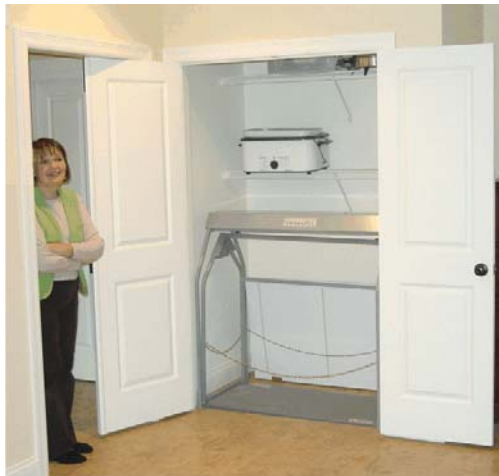
Installed in elevated or split-level homes, the Versa Lift saves carrying everything upstairs.