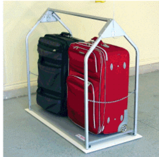
Luggage and Trunks