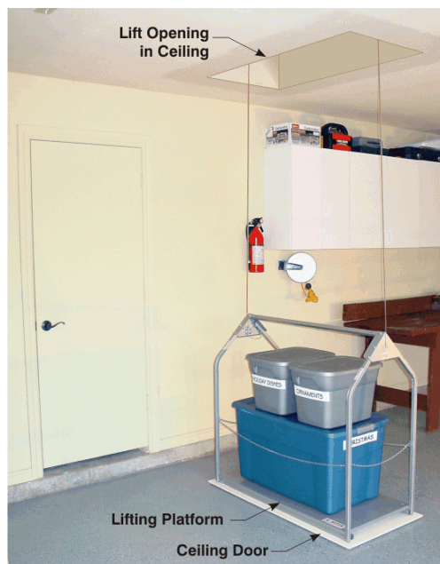
View from garage with lift platform down.

The Versa Lift is a powerful electric lift that eliminates the need to risk serious injury* by trying to get storage items up a narrow, shaky ladder. The push-button remote control sends down the lifting platform hidden inside the attic. The lifting platform stops instantly when it reaches the floor below. Next, you load the platform with up to 200 lbs. of storage items and press the up button on the hand-held remote control. In just seconds the load is transported into the attic and out of sight! Upstairs the lifting platform automatically stops flush with the attic floor so you can simply slide storage boxes off the platform without lifting them, a unique Versa Lift feature.