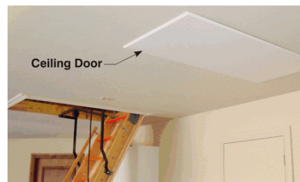
The lift automatically closes the ceiling door.

Another unique feature is the self-closing ceiling door attached to the lifting platform. When the platform is raised, the ceiling door is held tightly against the ceiling opening. The ceiling door can be insulated and sealed for use in a climate-controlled area. When not in use, the Versa Lift and lifting platform is hidden within the attic. All you see is the neat ceiling door overhead!