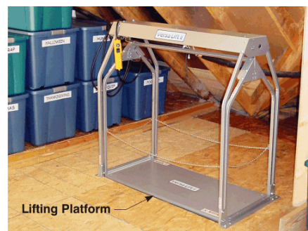
Lift platform stops level with the attic floor.