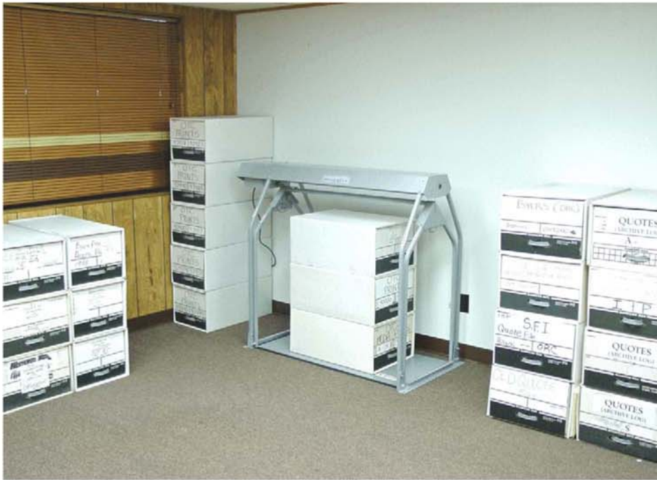
Business applications for the lift include moving supplies, and components, file boxes, etc. to upstairs storage rooms, assembly areas, mezzanines, or lofts.

While dumbwaiters are useful in multi-story dwellings, the Versa Lift system can be used to advantage when service is required between only two levels and it provides a larger payload capacity at a lower cost.