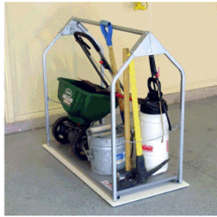
Spreaders, Sprayers, Shovels