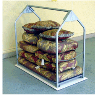
Pool & Patio Cushions