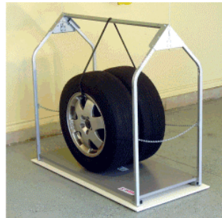
Wheels & Tires