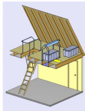
3. Store items in the attic