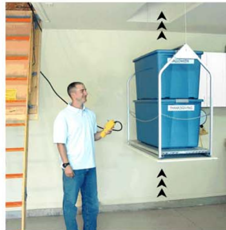
Store or retrieve hefty loads with push-button controls!

But don't despair! Now you can convert your attic into the ultimate storage solution. Just add some lights, plywood decking, and a Versa Lift and your attic can become a huge hidden storage area with push-button access to store and retrieve garage clutter items in seconds!