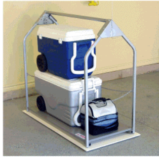
Ice Chests, Coolers

In addition to storage boxes and plastic bins, here are a few of the items you can make disappear like magic and get back just as fast: