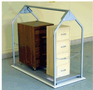
File Cabinets, Tax Records