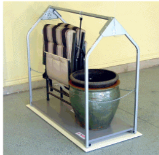
Lawn Chairs, Planter Pots