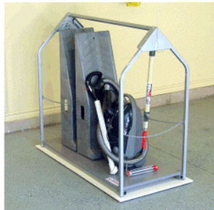
Auto Ramps, Painting Tools