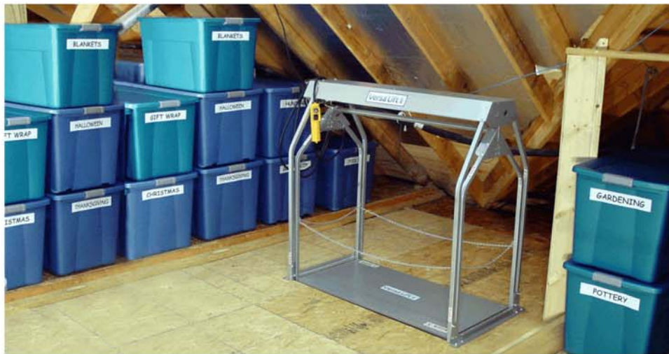
Automated solution: Out-of-sight storage with push-button access.