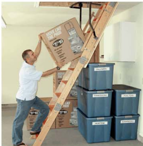
Carrying heavy items up attic stairs is difficult and dangerous.

Most homes have usable attic storage space, but it is typically either undeveloped, or at least, under-developed. Your attic may be poorly lighted, might not have decking (flooring) over the ceiling joists and, typically, the only way to put things up there is to carry them up the narrow ladder... not only difficult, but also very dangerous.