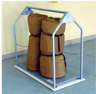
Camping Bags, Tents, & Gear