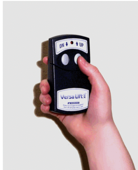
Wireless remote for extended mobility

The lift operation is controlled by either a corded remote control or a wireless remote, similar to a garage door opener. Corded models feature a 15-foot cord and a key-locking main switch to prevent unauthorized use. Wireless models feature a radio remote for maximum mobility that can be stored securely out-of-reach wherever you choose.