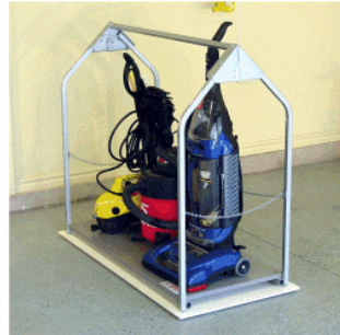
Pressure Washer, Vacuums