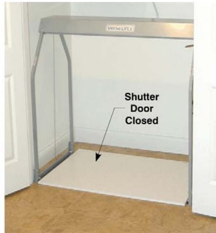
Whenever the lifting platform is lowered, the auto-shutter option closes the opening.

In addition to attic installations, the Versa Lift is an ideal solution for split-levels, elevated coastal homes, and basements. Whenever the living level of the home is above or below the entry level, homeowners are faced with the never-ending task of carrying everything up or down stairs. Items such as groceries, laundry, dry cleaning, and other household supplies all have to be toted to or from the garage/entry level of the home to the living quarters... that is, unless a utility lift is installed in the home.