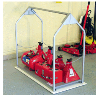
Tools, Jack Stands, Air Tanks