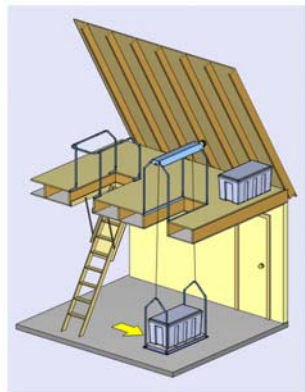
1. Place items on platform