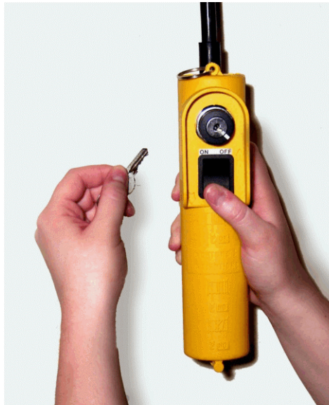
Standard remote with locking key switch