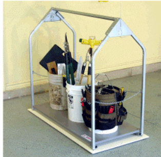
Tool Buckets & Hand Tools